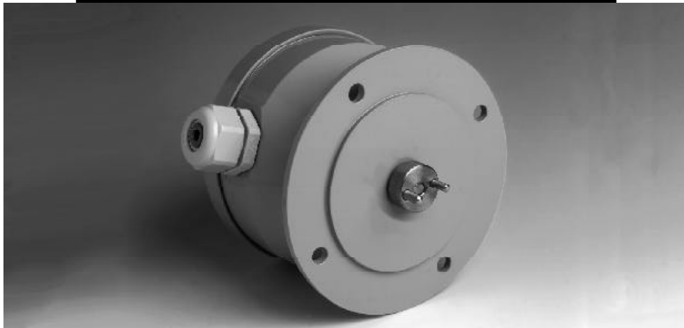
Fig. 1: AI-Ni 6